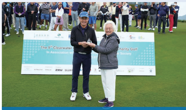
“The 9th Clearwater Bay and Country Club Charity Golf” by HKACS 《第九屆香港防癌會慈善高爾夫球賽》