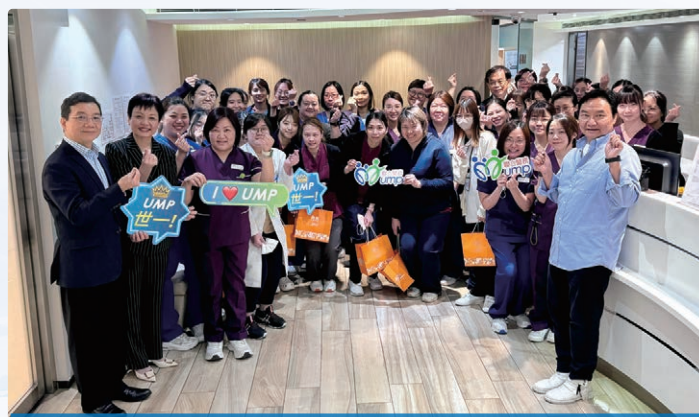
Gratitude to the healthcare team on "International Nurses Day" 藉「國際護士日」向醫護同事致意