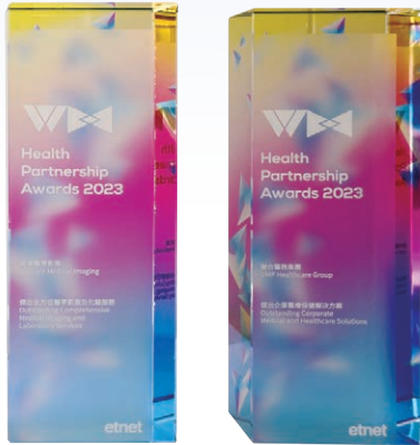
“Health Partner Awards 2023” by ETNet 經濟通《健康同行夥伴大獎2023》