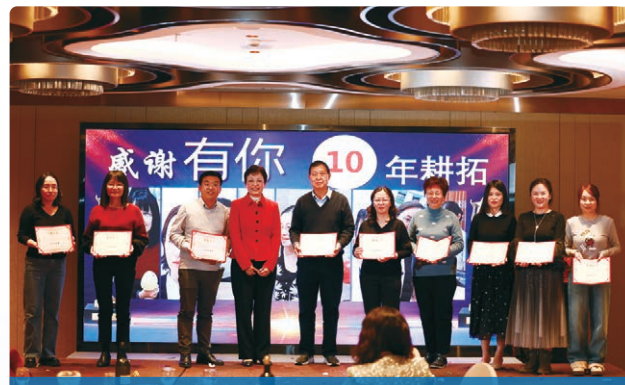
New Year celebration dinner for Mainland China teams 中國內地團隊新年慶祝晚宴