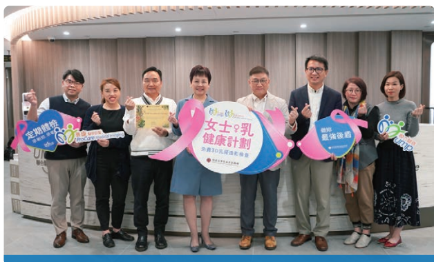
“Radiant Care for Healthy Breasts” 《女士•乳•健康計劃》