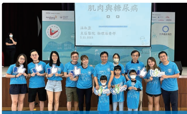
“Walk for Diabetes 2023” 《糖尿健步行2023》