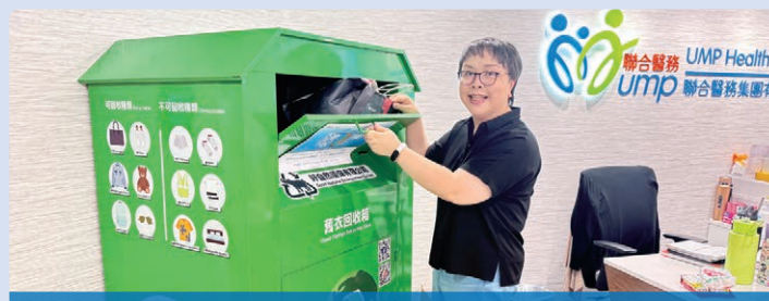
Used-clothes recycling program to encourage staff to adopt eco-friendly practices 舊衣回收活動鼓勵員工踐行環保