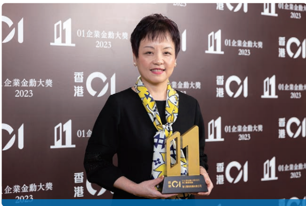
“01 Gold Medal Awards 2023 – Outstanding Medical Group” by HK01 香港01《01企業金勳大獎2023－傑出醫療集團》