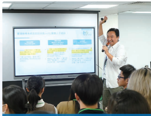
“Medical Service Career Seminar” for CDIA’s Y-WE Programme 《Y-WE我才有用青少年工作體驗計劃》醫療服務就業分享講座

於2024財政年度，我們捐贈超過600,000港元至多個教育、健康及環境慈善團體。