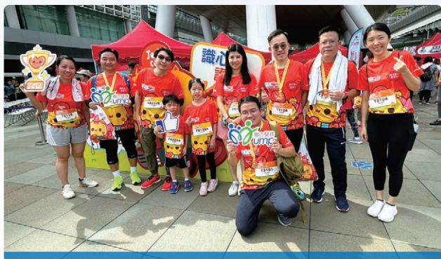
“Carnival cum Run for Heart 2023” 《世界心臟日2023健心跑》暨心臟健康嘉年華