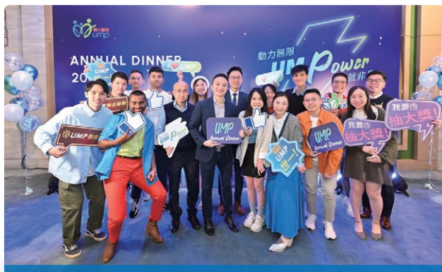
Annual Dinner 2023 for Hong Kong and Macau teams 香港及澳門2023週年晚宴

聯合醫務深明人力資源是其最寶貴的資產，是其競爭優勢的核心源泉，亦是其可持續發展的根基。因此，本集團致力加強其僱傭政策，以吸引、培育及挽留優秀人才。本集團堅持以人為本，重視並保障所有僱員的合法權益，同時實施有效的勞動管理常規，確保僱員的職業健康與安全。於報告期間，本集團並不知悉任何違反有關薪酬及解僱、招聘及晉升、工作時數、假期、平等機會、多元化、反歧視以及其他待遇及福利等對本集團有重大影響的相關法律及規例的情況。