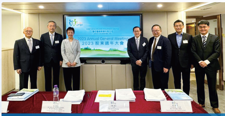
Annual General Meeting 2023 2023年股東週年大會