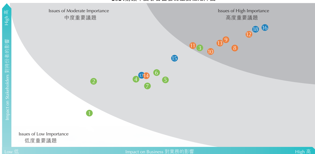
Materiality Matrix of UMP in FY2024 2024財政年度聯合醫務的重要性矩陣圖

本報告中所指的重要議題是指可能對本集團的業務營運造成重大影響或對持份者造成實際影響的議題。為了識別該等議題並排定優先處理的次序，本集團每年均進行重要性評估，並以矩陣圖的形式呈現重要性評估結果。