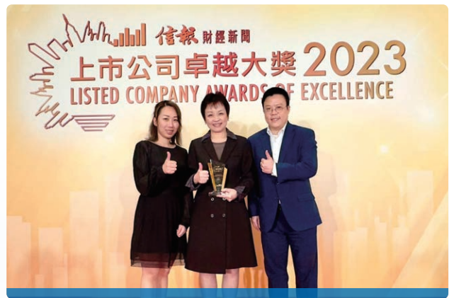
“Listed Company Awards Of Excellence 2023” by Hong Kong Economic Journal 信報《上市公司卓越大獎2023》