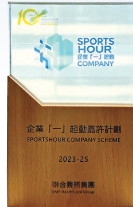
“SportsHour Company Scheme Recognised Company” by InspiringHK Sports Foundation 凝動香港體育基金《企業「一」起動》嘉許企業