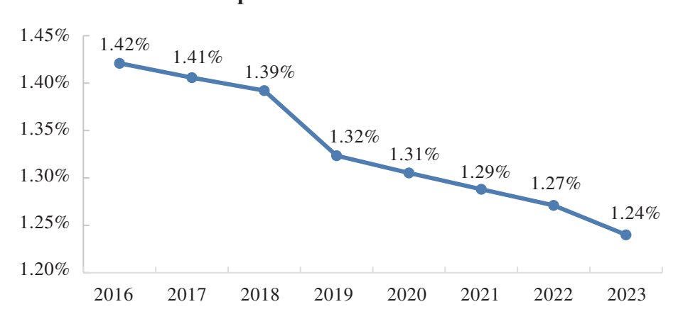
The Composite Rate from 2016 to 2023

Since the listing of H Shares of the Bank in 2016, the Composite Rate decreased from 1.42% by 18 BPs to 1.24% in 2023, representing a decrease of 12.52%, as shown in the following chart: