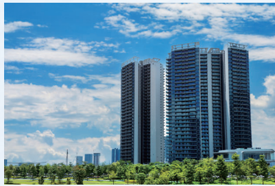
廣州曜玥灣 | 鉅森江海 Guangzhou Yaoyue Bay | Bosen Jianghai