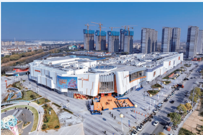
淮安旭輝 Cmall Huai'an CIFI Cmall