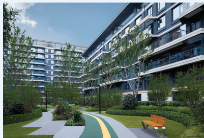
成都恒基旭輝中心 Chengdu Henderson CIFI Centre