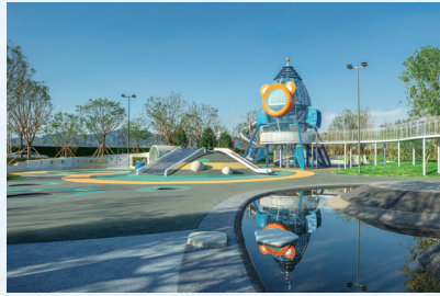
北京國祥源境 Beijing Park City