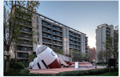
北京公園都會 Beijing Park City