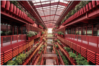
上海恒基旭輝天地 Shanghai The ROOF