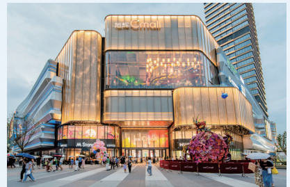
成都溫江旭輝 Cmall Chengdu Wenjiang CIFI Cmall