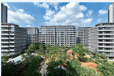
蘇州錦麟館悅府 Suzhou Jinlin Park Mansion