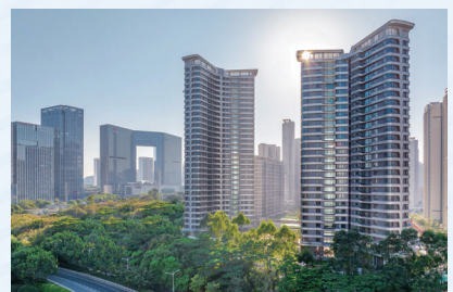
廈門旭輝館悅五緣灣上 Xiamen CIFI Park Mansion Wuyuan Bay