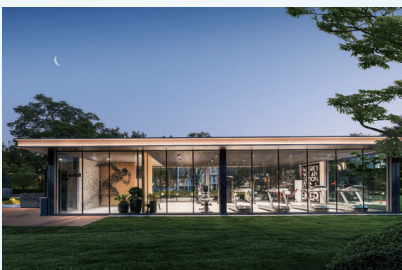
南京晴翠府 Nanjing Qingcui Mansion