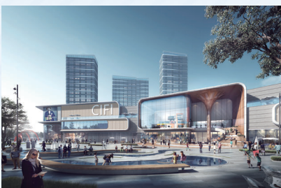
長沙雨花旭輝里 Changsha Yuhua CIFI Lane