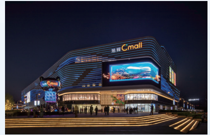
南昌旭輝 Cmall Nanchang CIFI Cmall