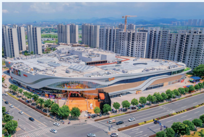
紹興旭輝 Cmall Shaoxing CIFI Cmall