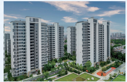
長沙鉅宸府 Changsha Central Palace