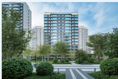
天津旭輝·濱海江來 Tianjin Binhai Jianglai Mansion