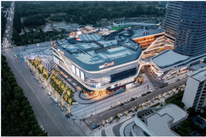
成都新都旭輝 Cmall Chengdu Xindu CIFI Cmall