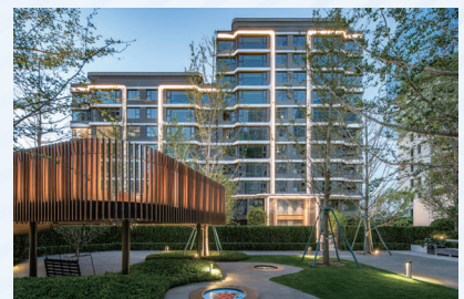
天津旭輝鉅悅公望 Tianjin CIFI Park Mansion