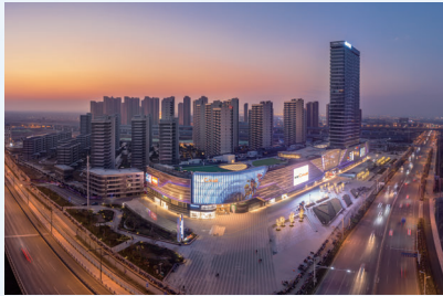
合肥肥西旭輝 Cmall Hefei Feixi CIFI Cmall