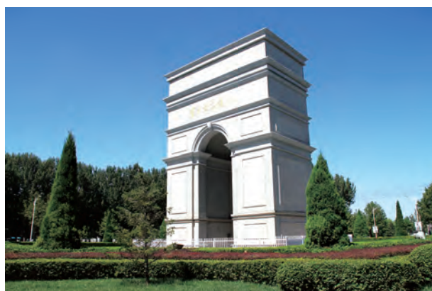
▲ Campus environment