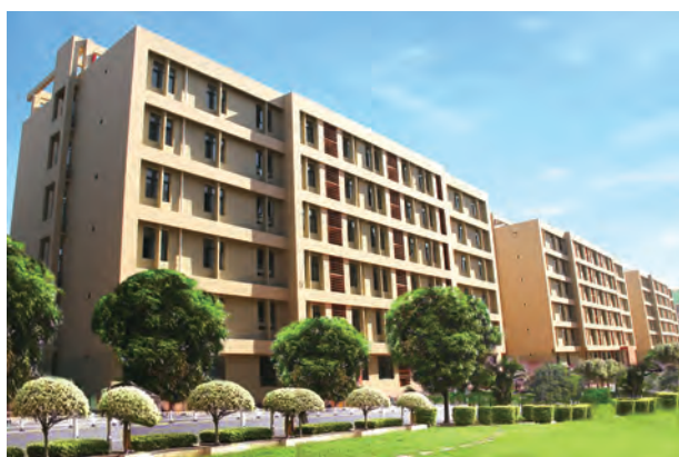
▲ Environmental enhancement on campus site

The Group engages a gardening service provider to provide gardening services on its campus site, including the removal of any unwanted or dead plants and replenishment with new seed beds and healthy plants. The gardening service provider has to comply with the Group's internal guidelines on Gardening Maintenance Scheme (《綠化養護方案》), Gardening Maintenance Operation Guideline (《綠化養護操作規範》) together with Gardening Maintenance Quality and Examination Standards (《綠化養護質量與考核標準》) which set out the frequency of fertilization on different types of plants, and guidelines for tree cutting and trimming, removal of dead plants and application of disinfectants.