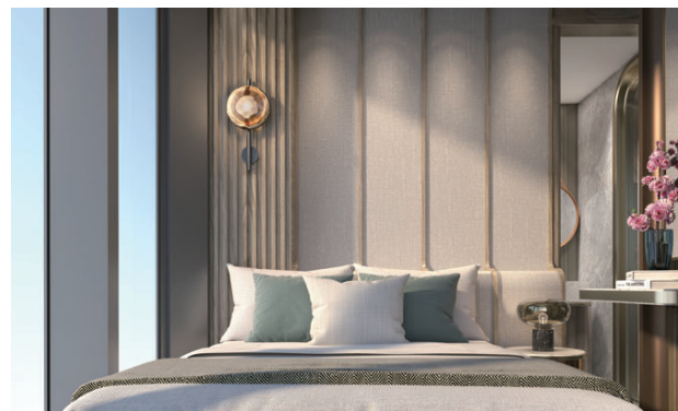
★ All of the above are perspectives of interior design.