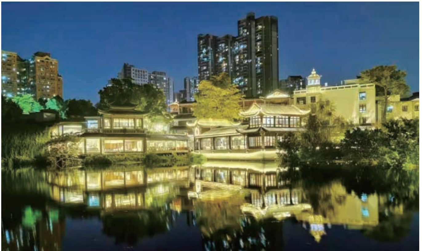
Night view of Panxi Restaurant in Guangzhou 廣州泮溪酒家夜景

集團在零售市場擁有「零食物語」日本零食專門店、「日本雪糕屋」日本特色雪糕及零食專門店、「YOKU MOKU」曲奇餅店等品牌，繼續推陳出新。集團經營的「宮田商店」以銷售正宗日本進口食品為主，「宮田商店」持續受到香港消費者的熱烈追捧。自開業以來，始終堅持引進最地道的日本美食，為香港的美食愛好者帶來一次次驚喜和滿足。從高檔的和牛、梅酒到日本糖果小食、日本雞蛋、日本食米等日常食品，「宮田商店」應有盡有。每一件商品都經過嚴格挑選。消費者來到宮田商店，就像穿越到了日本本土一般，令人流連忘返。位於汕頭小公園，由集團經營的香港四洲食品城亦於2024年1月正式開張，專門銷售本集團的產品，進一步把握粵港澳大灣區內的發展潛力。