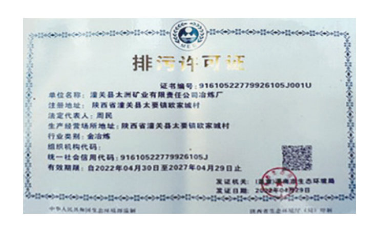
Taizhou Mining has obtained a pollution discharge permit 太洲礦業已取得排污許可証書

本集團在廢水控制及循環再用方面投入 大量生產成本以符合《污水綜合排放標準》。廢水內僅包含少量有害物質,沒有 發現不符合《污水綜合排放標準》。