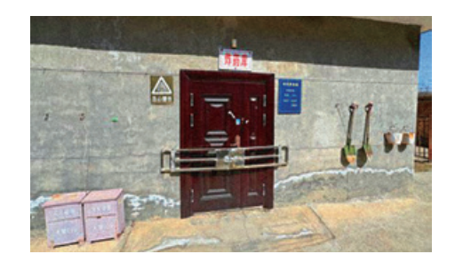
Safety facility outside warehouse storing detonators 炸藥庫外的安全設備

本集團使用炸藥開採金礦物,並嚴格遵 守與中國標準貫徹一致的炸藥使用規 則及法規。本集團設有經安全機構及控 制物資的地方公安機關批准並根據其 規定標準設計的專門、專用及隔離的炸 藥庫。雷管及炸藥存放於兩個獨立的庫 內,彼此之間存有安全距離。該等庫房 所在的院落完全被高牆、金屬門及24小 時監控攝像頭護衛。兩間炸藥庫均各有 兩把鎖、鎖匙由兩名獨立僱員(一名管理 人員及一名安全人員)保管。僅於該兩 名人員(鎖匙保管人)同時出現方能完全 打開全部門鎖,方可取得雷管及/或炸 藥。存儲設施由管理層以及安全及公安 機關定期檢查,以確保始終合規。使用 炸藥後,本集團將使用檢測設備測量空 氣殘餘物數量,待空氣符合標準後方會 安排僱員進入金礦。