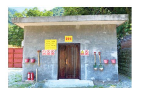
Safety facility outside explosive storage 雷管庫外的安全設備