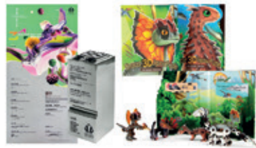
國際數碼企業聯盟印製大獎 - 銀獎 - 恐龍立體拼圖 Idealliance Printing Award - SILVER - Dinosaur 3D Jigsaw Puzzle