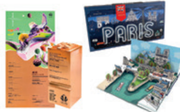
書刊印刷 - 銅獎 - 法國, Voyage Anime Book Printing - BRONZE - Paris, Voyage Anime