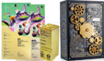
包裝印製 - 金獎 - 懷售夾萬齒輪酒盒 Packaging Printing - GOLD - with Gear Wine Box