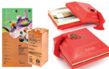
國際數碼企業聯盟印製大獎 - 銅獎 - 朱古力天地蓋盒加如意結 Idealliance Printing - BRONZE - CNY Chocolate Box