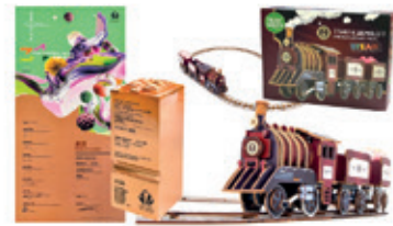
國際數碼企業聯盟印製大獎 - 銅獎 - 蒸汽火車 Idealliance Printing Award - BRONZE - America Steam Train