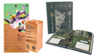
書刊印刷 - 銅獎 - 失落的世界 Book Printing - BRONZE - The Lost World