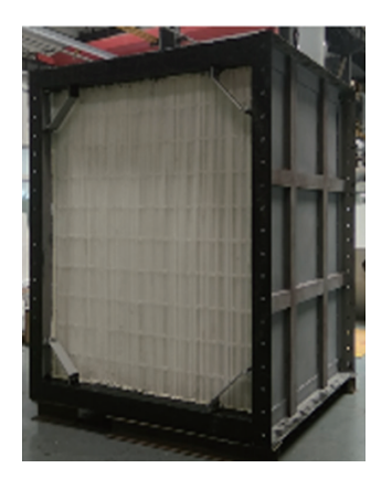
Plate form modified polymer phase transition agglomerator

The product's core is made of modified polymer plates and the shell is made of metal with anti-corrosion coating. It is mostly used in flue gas de-whitening projects. Compared with material such as metal and glass, plate form polymer phase transition agglomerator is compact and lightweight, and is resistance to acidic corrosion of sulfur and nitrogencontaining compounds.