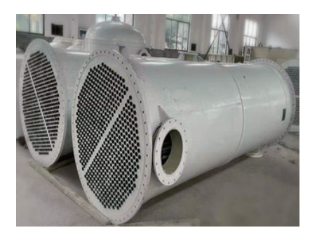
Tube form modified polymer phase transition agglomerator

The product's core is made of modified polymer tube and the shell is made of modified polymer material. It is mostly used in waste heat recovery projects. It can also be used in corrosive liquid environment with low temperature.