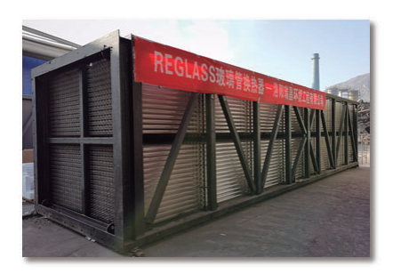
Glass tube phase transition agglomerator

The product's core is made of glass tube and the shell is made of metal with anti-corrosion coating. It is mostly used in flue gas de-whitening projects. Compared with modified polymer material, glass tube heat exchanger has better heat and corrosion resistance.