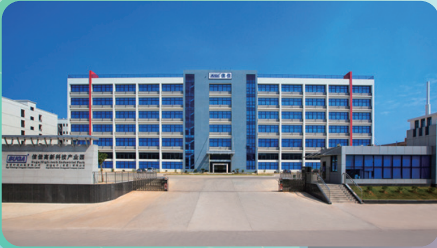
Factory in Dong Guan 東莞廠房