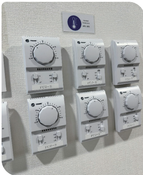
The office temperature has been standardized to reduce energy consumption while maintaining a comfortable working environment.

This year, Cornerstone Technologies has undertaken several initiatives to reduce resource consumption in the office. One of these is the push to cut back on office energy use. Employees have been reminded to turn off lights when not in use, a simple yet effective way to conserve energy. Besides, the office temperature has been standardized to reduce energy consumption while maintaining a comfortable working environment. These actions, while seemingly small, are steps towards the company's larger goal of minimizing its carbon footprint.