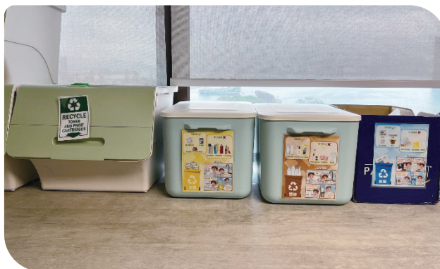
Waste segregation bins collecting aluminum, plastics and toners are provided to boost the recycle rate in offices.