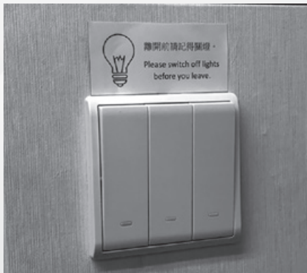
Energy saving signs remind staff members to turn off the lights after using in order to promote energy conservation. 張貼節能標誌提醒員工用後關燈以推動節能。