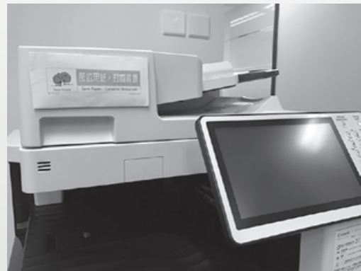
Notice of Printing and photocopying control for paper saving. 張貼列印及影印管制通知以節約用紙。