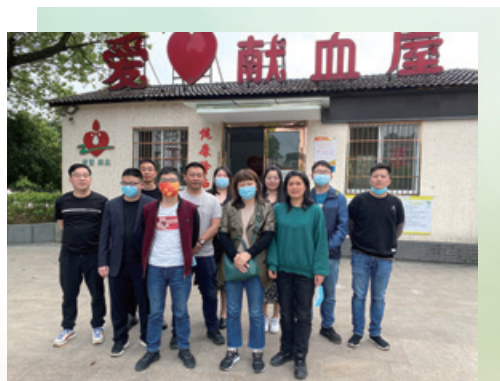
Voluntary blood donation 自願捐血活動