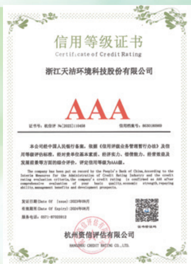
“Certificate of AAA Credit Rating from Hangzhou Credit Rating Co., Ltd.” 《杭州資信評估有限公司AAA級信用等級證書》