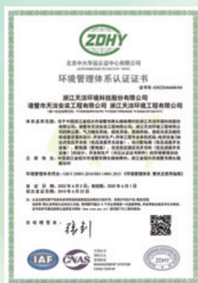
Environmental Management System Certification 《環境管理體系認證證書》 (GB/T 24001-2016/ISO 14001:2015)