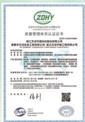
Quality Management System Certification 《質量管理體系認證證書》 (GBT 19001-2016/ISO 9001:2015)

本集團於營運過程中可能對環境和自然資源造成影響的主要排放物為大氣污染物及廢棄物。我們已採取必要的內部環境保護措施以防止對環境造成污染。我們已建立《質量、環境和職業健康安全手冊》並取得下列證書，證明我們提供的服務及產品受到國家認可：