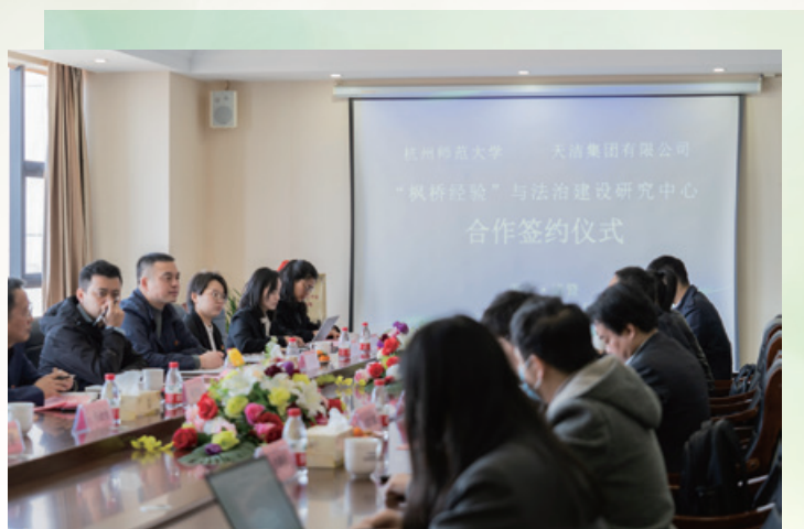
Strategic collaboration in corporate management 企業管理戰略合作

報告期間，我們並沒有發現涉及違反有關貪污、賄賂、勒索、欺詐及洗黑錢的法律和規例的訴訟及投訴，亦未知悉有任何經提出並已審結的貪污訴訟案件及訴訟結果。