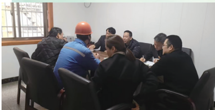
Occupational safety meetings 職業安全相關會議

為保障員工的身體健康，本集團向員工提供身體檢查。在報告期間，我們為殘疾及有困難的職工送上慰問，致力於關懷員工，更組織員工如焊工、油漆工參加體檢。另外，我們依據國家關於職業病防治的技術規範和要求，按照崗位差異確定員工的檢查項目，在報告期間，大約有88位員工參加體檢，主要包括血壓、血常規檢查、尿常規檢查、肺功能、心電圖、電反應測聽、神經系統和生化檢驗等。