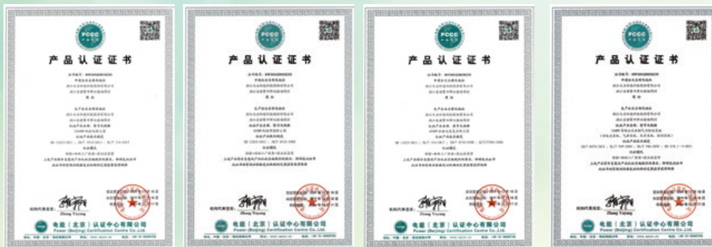
Certificate of Product Certification – Power (Beijing) Certification Centre Co., Ltd. 《電能（北京）認證中心有限公司—產品認證證書》

經過檢查評核後，專家組認為天潔環境的產品能滿足技術規範、客戶的要求、技術管理、生產設施、採購管理、質量管理等方面的要求以及符合相關標準，故此，電能（北京）認證有限公司將繼續頒發浙江天潔環境科技股份有限公司所申請的各項電能產品認證證書。