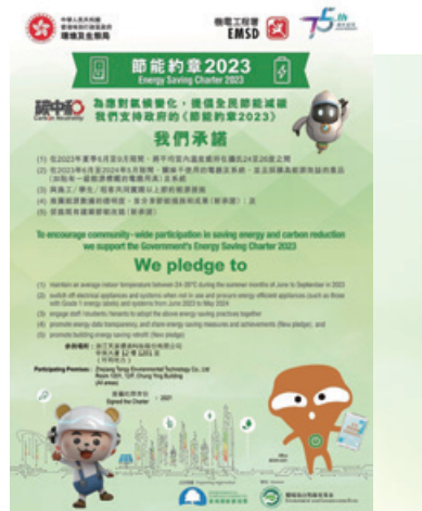
“Energy Saving Charter 2023” 《節能約章2023》