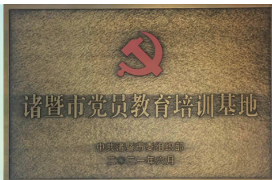
“Zhuji Municipal Education and Training Base” 《諸暨市黨員教育培訓基地》