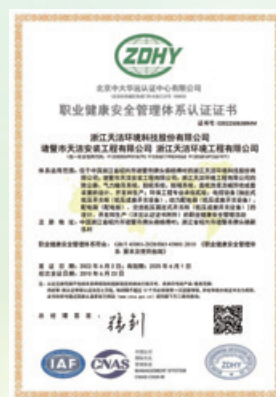
Occupational Health and Safety Management System Certification 《職業健康管理體系認證證書》 (GB/T 45001-2020/ISO 45001:2018)