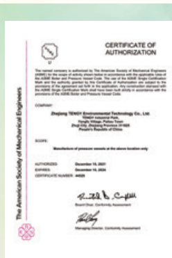
Certificate of Authorization issued by the American Society of Mechanical Engineers 美國機械工程師學會頒發的製造許可證