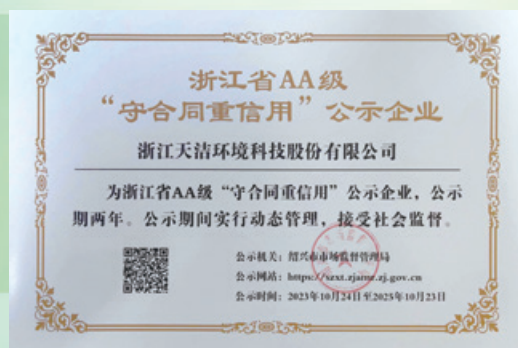
“AA Grade Contract-abiding and Promise-keeping Enterprise in Zhejiang Province” 《浙江省AA級守合同重信用》