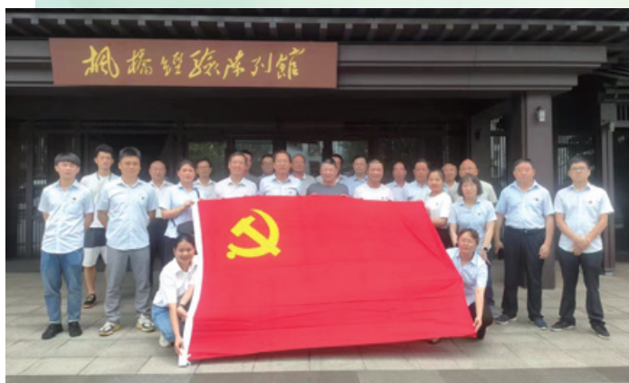
Organizing employee participation in party committee activities 組織員工參與黨委活動