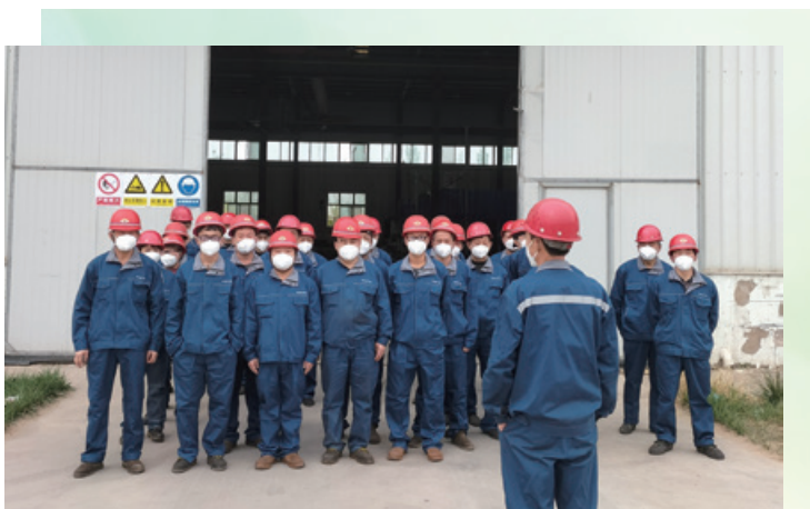
On-site safety production training 現場安全生產培訓

與此同時，我們明白員工的個人發展和集團發展非但不相衝突，而是互相促進的關係，所以會向取得與工作有關的專業資格的員工發放證書補貼，以推動企業內部鼓勵持續進修的文化氛圍。