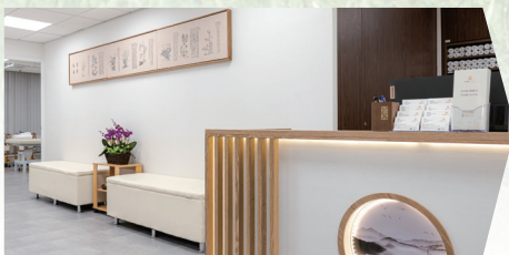
TDMall (Tsim Sha Tsui) 天大館(尖沙咀)