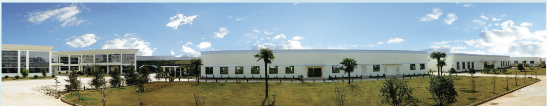
R&D and Production Base (Kunming, China) 研發及製藥基地(昆明)