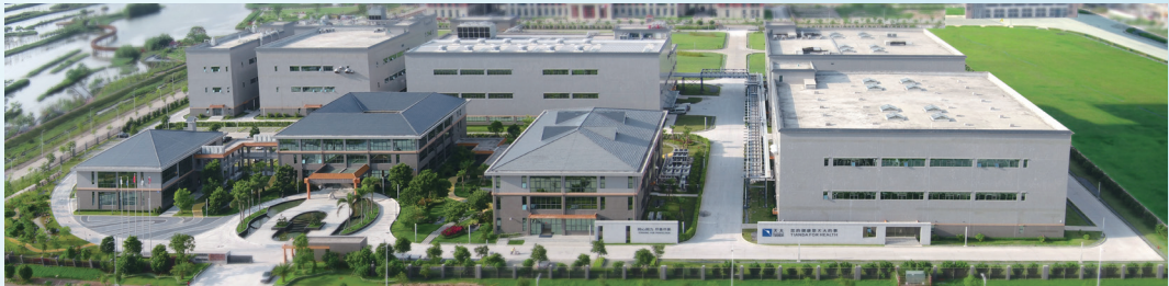
New R&D and Production Base (Jinwan District, Zhuhai) 新研發及製藥基地(珠海金灣)