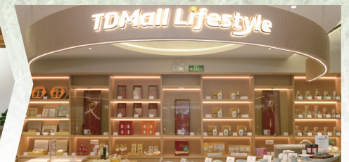
Shenzhen TDMall 深圳天大館