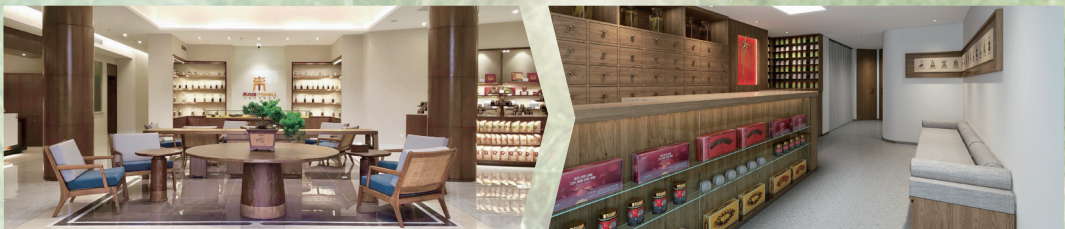
Zhuhai TDMall 珠海天大館