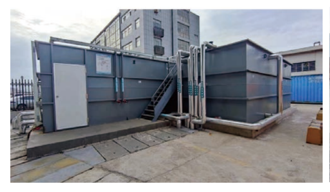
The sewage treatment station in Lianyungang New Oriental Terminal is used to treat and purify the sewage to achieve the discharging standard or reuse.