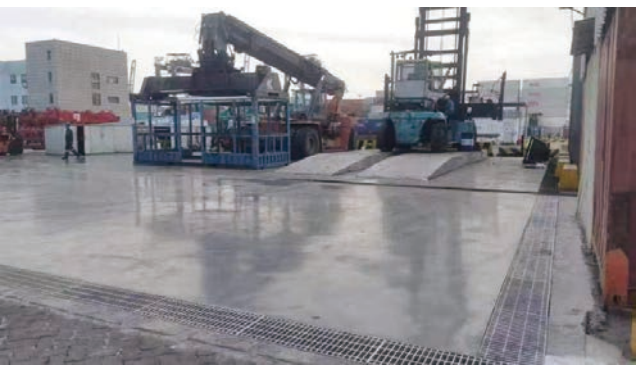
The sewage recycling facility in Xiamen Ocean Gate Terminal is used to collect, precipitate, and reuse the sewage after vehicle cleaning.