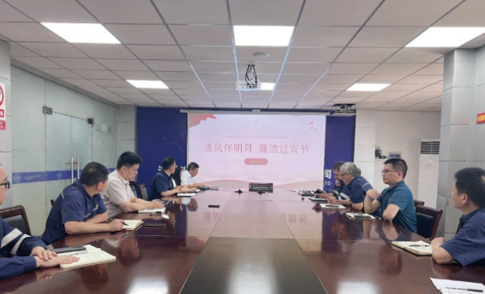
During the year, Lianyungang New Oriental Terminal launched the "Month of Business Integrity Education" and held integrity reminder talks to strengthen employees' awareness of integrity and self-discipline.

The Company has formulated the <u>Whistleblowing Policy</u>, to standardise the reporting procedures and investigation measures of the Company and its subsidiaries. It provides a formal and confidential reporting channel for all members of the Company or others who do business with the Company, such as customers and suppliers.