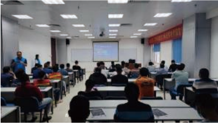
Guangzhou Terminals, the Nansha Police Station and the Comprehensive Management Office of Longxue Street jointly organised a training session on internet fraud to help terminal workers improve their ability to identify and prevent internet fraud.