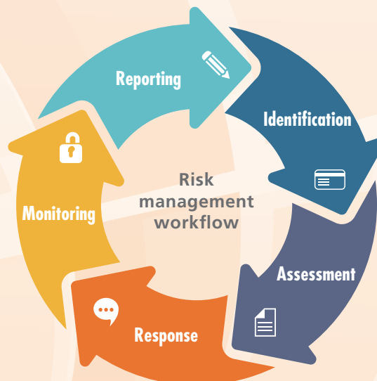
Figure 1: Risk management workflow