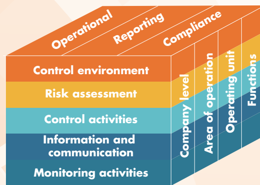
Figure 3: COSO Internal Control and Management Framework

The Group has established its own internal control system by making reference to the internal control framework of the Committee of Sponsoring Organizations of the Treadway Commission (COSO) (please refer to figure 3: COSO Internal Control and Management Framework below). The Group's internal control system consists of five interdependent elements, which coordinate and operate to ensure the effectiveness of internal control functions of the Group. The five elements are: control environment, risk assessment, control activities, information and communication and monitoring activities.