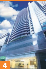
4 Prosperity Place 泓富廣場