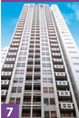
7 New Treasure Centre Property (portion) 新寶中心 (部分)