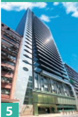
5 Trendy Centre 潮流工貿中心