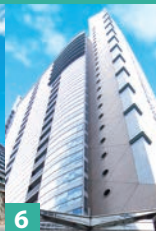
6 Prosperity Center Property (portion) 創富中心 (部分)