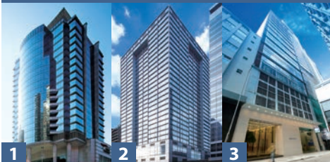
1 The Metropolis Tower 都會大廈