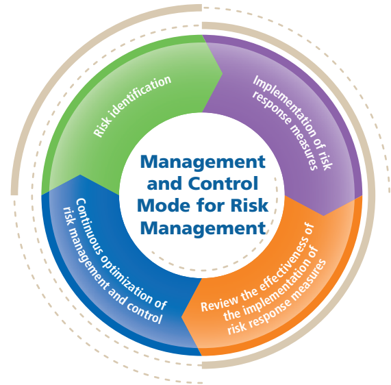
(Figure 2: Management and Control Mode for Risk Management)

During the Year, the management of the Group followed up on the implementation of the risk management improvement measures identified in prior year's risk assessment, as well as establishing a continuous risk management cycle which contains the process of "Risk assessment — Implementation of the risk management procedures — Follow-up of the implementation of risk management measures — Risk management system ongoing monitoring" in order to ensure that the any risk management gaps are rectified and the ability to prevent and cope with risks is strengthened (for details, please refer to Figure 2: Risk assessment and management model).