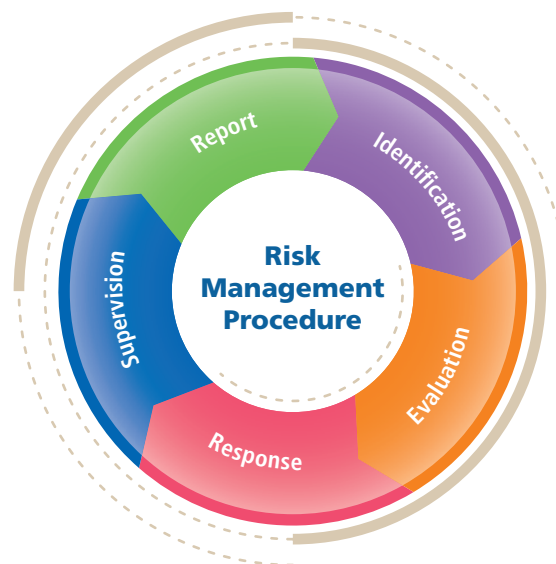
(Figure 1: Risk Management Procedures)