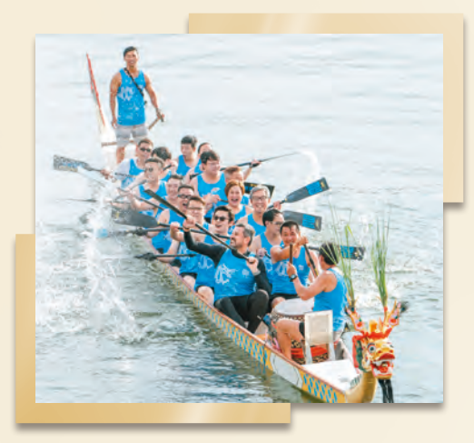
A Dragon Boat Racing Team was formed to foster the importance of work-life balance and team spirit.