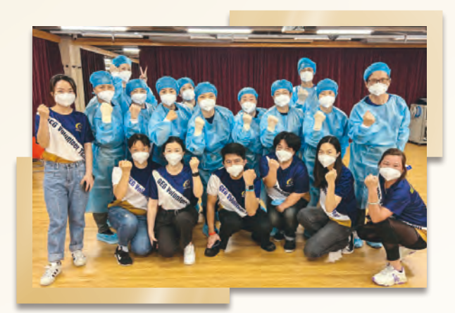
GEG volunteers assisted the city's multiple NATs.