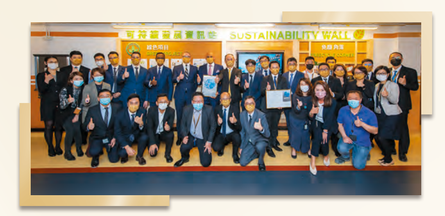
GEG obtained the EarthCheck Silver Certification for Galaxy Hotel \ensuremath{^{\mathsf{TM}}} .

GEG has a comprehensive recycling program in place at all our properties. Despite having suspended food waste recycling and decomposing at our properties since the onset of COVID-19 as a pandemic prevention measure, in the first half of 2022, GEG continued to recycle approximately 286.7 tons of cardboard and paper materials, 17.2 tons of plastics, 23.2 tons of metals, 16.8 tons of glass bottles, 22.1 tons of waste oil, and 0.5 tons of printer cartilages.