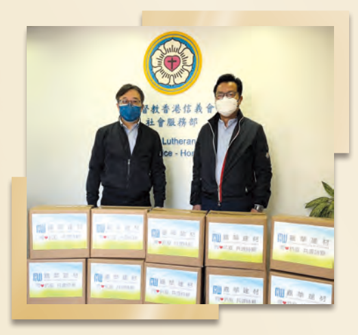
CMD donated rapid antigen test kits to low-income groups, elderly and frontline anti-epidemic personnel through various organizations.

CMD values employees' wellbeing and health. Focusing on creating a harmonious workplace, CMD continues to organize an expansive range of wellness activities including Lunch & Learn Workshop, talks and festival celebrations. A Dragon Boat Racing Team was also formed to foster the importance of work-life balance and team spirit.