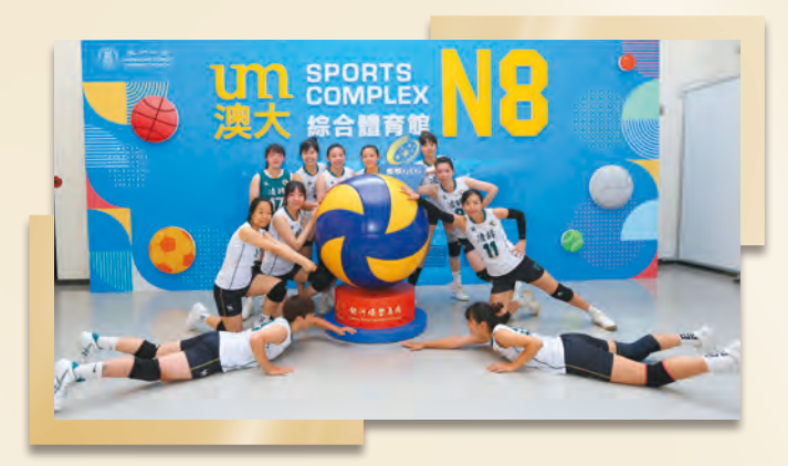
GEG title-sponsored the "GEG Presents: 1st Volleyball Super Bowl" organized by the Volleyball Association of Macau, China.