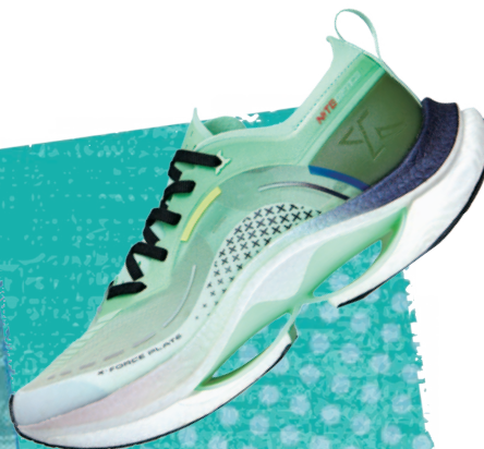
REACTIVE COIL 9.0