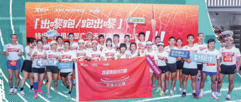
Guangzhou Xtep Running Club (231 sqm)