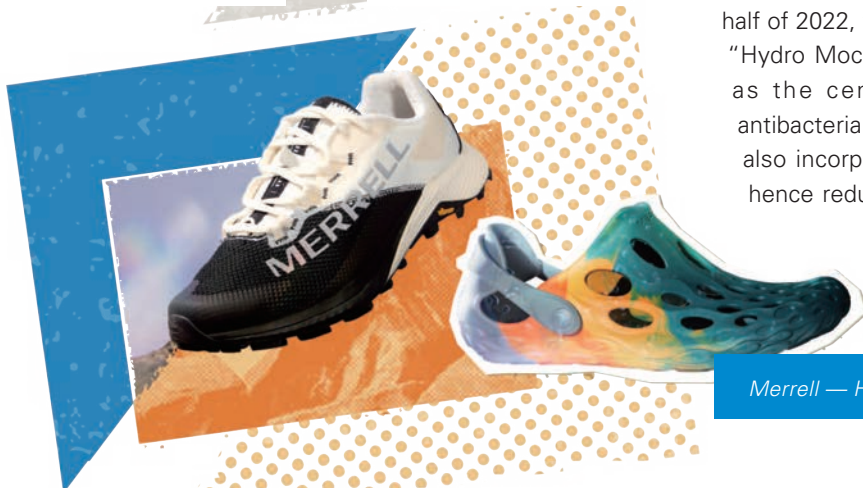
Merrell — Hydro Moc Bloom

Merrell has always been at the forefront of taking initiatives to create an eco-friendly future. In the first half of 2022, the brand launched a new generation of “Hydro Moc Bloom shoes”, with interstellar colors as the central design theme. Featuring an antibacterial ultra-light midsole, each pair of shoes also incorporated 10% BLOOM™ algae biomass, hence reduced the use of petroleum in traditional footwear foam, and echoed the environmental protection philosophy of Merrell.