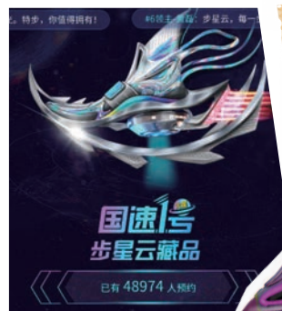
Guosu No. 1