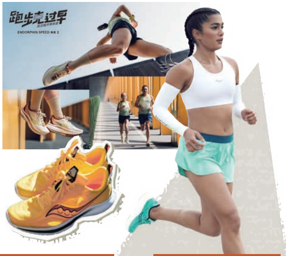
Saucony — KINVARA 13