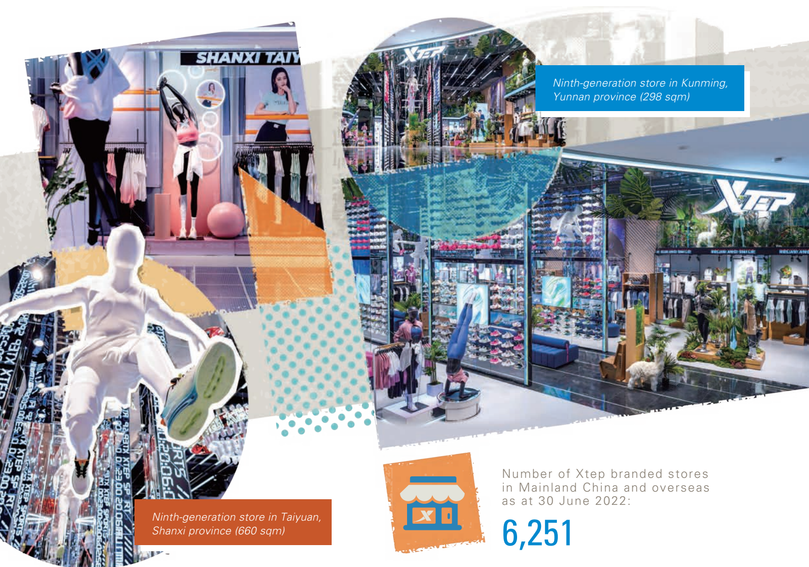
Ninth-generation store in Kunming, Yunnan province (298 sqm)

Customer experience has always been a major determinant of brand loyalty and customer retention rate. Our ninth-generation stores with larger store size and digital innovation, such as lighting control, AI robots, digital signage and rising stages, have drastically enhanced our brand image and allowed us to have an increase in foot traffic and cross-selling ratio. These improvements, as a result of an extensive product range and immersive retail experience offered in our ninth-generation stores, will drive us to further achieve excellence in retail channel upgrade.