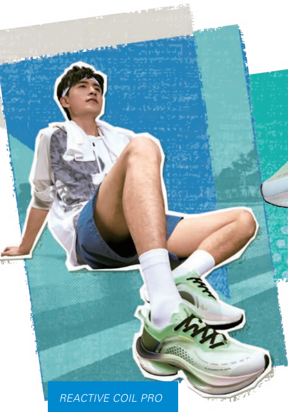
REACTIVE COIL PRO