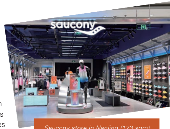
Saucony store in Nanjing (123 sqm)

Retail sales of the professional sports segment from offline business were dampened by the temporary store closures due to the lockdown measures enforced in higher-tier cities since mid-March. In light of this, we devoted more effort to driving e-commerce expansion and minimizing such impacts. During the 618 Shopping Festival, Saucony’s online sales rocketed 135% year on year, demonstrating a resilient growth. Since Saucony bears a striking resemblance to the core Xtep brand in which they both possess strong brand identity in running, we swiftly expanded Saucony’s exposure in other cities in Mainland China through the Xtep Running Clubs and successfully increased its brand awareness. In the second half of 2022, more Saucony and Merrell stores will be launched in higher-tier cities in Mainland China to sustain their future growth plan. As at 30 June 2022, there were 46 and seven self-operated stores for Saucony and Merrell in Mainland China, respectively.