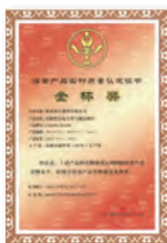
2005 (Renewed in 2011/2012/2015 續) 冶金產品實物質量 金杯獎(高頻焊管) (中國鋼鐵工業協會) Gold Cup Prize for Actual Quality of Metallurgical Products* – ERW (China Iron & Steel Association*)