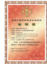
2005 (Renewed in 2011/2012/2015 續) 冶金產品實物質量 金杯獎(直縫埋弧焊管) (中國鋼鐵工業協會) Gold Cup Prize for Actual Quality of Metallurgical Products* – LSAW (China Iron & Steel Association*)