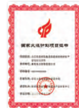
2007 國家火炬計劃項目 (中國科學技術部) China Torch Item* (Science and Technology Department of the PRC*)