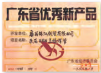
1996 廣東省優秀新產品 (廣東省經濟委員會) Guangdong Province Outstanding New Product* (The Economic Commission of Guangdong Province*) GPEC