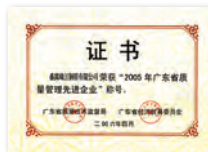
2006 2005 年廣東省質量管理 先進企業 (廣東省質量技術監督局) Leader in Quality Management in Guangdong Province in 2005* (Guangdong Provincial Bureau of Quality and Technical Supervision*)