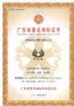
2002 (Renewed in 2010/2014 續) 廣東省著名商標 (廣東工商行政管理局) Guangdong Province Famous Trademark* (Guangdong Province Bureau for Administration of industry and Commerce*)