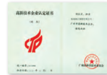
2001 高新技術企業認定證書 (廣州市科學技術委員會) Certificate for the Recognition of High and New Technology Enterprises* (Guangzhou City Science and Technology Committee*)