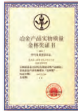
1997 冶金產品實物質量金杯獎 (中國冶金工業部) Gold Cup Prize for Actual Quality of Metallurgical Products* (Ministry of Metallurgical Industries of the PRC*)