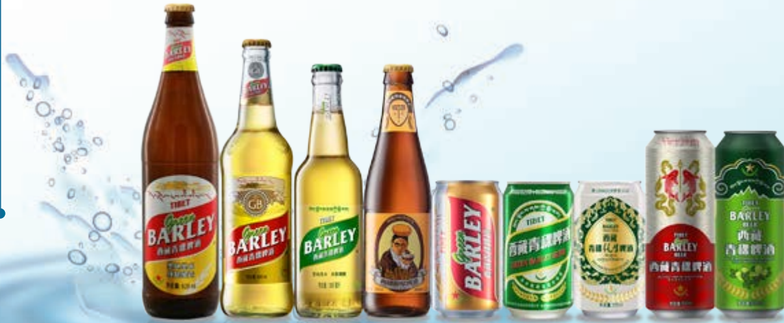
PREMIUM TIBET HIGHLAND BARLEY BEER 高端西藏高原青稞啤酒