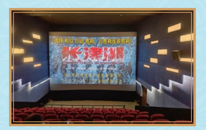
The Group's subsidiary, Suzhou Henge, organized a group activity for its employees to watch Battle of Chosin Reservoir 集團下屬蘇州亨冠公司組織員工集體觀影長津湖