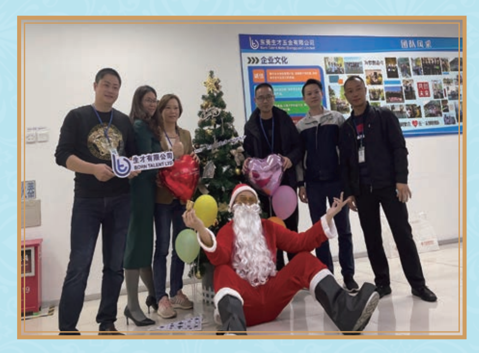
The Group's subsidiary, Dongguan Born Talent, held a Christmas party 集團下屬東莞生才公司聖誕活動