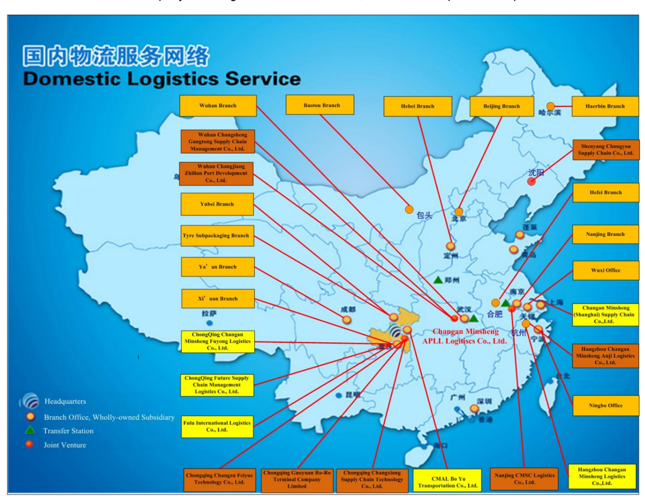
Picture 2: Location of the Company's existing branches, subsidiaries, associated compaies and representative offices

As at 31 December 2021, the Company had a total of 27 branches, subsidiaries, associated companies and representative offices, which are mainly located in East China, Central China, North China, South China and Southwest China (Picture 2). The continuous enhancement of service network enables the Group to provide logistics services to different parts of the country.