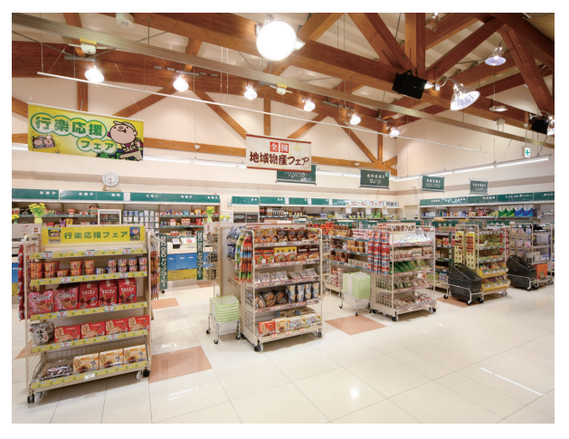
Prize display area