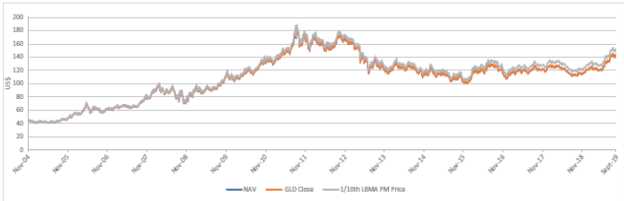
Share price & NAV v. gold price – November 18, 2004 to September 30, 2019

The following chart provides historical background on the price of gold. The chart illustrates movements in the price of gold in U.S. dollars per ounce over the period from 18 November 2004 to 30 September 2019, and is based on the LBMA Gold Price PM (since 20 March 2015) and the London PM Fix (prior to 20 March 2015).