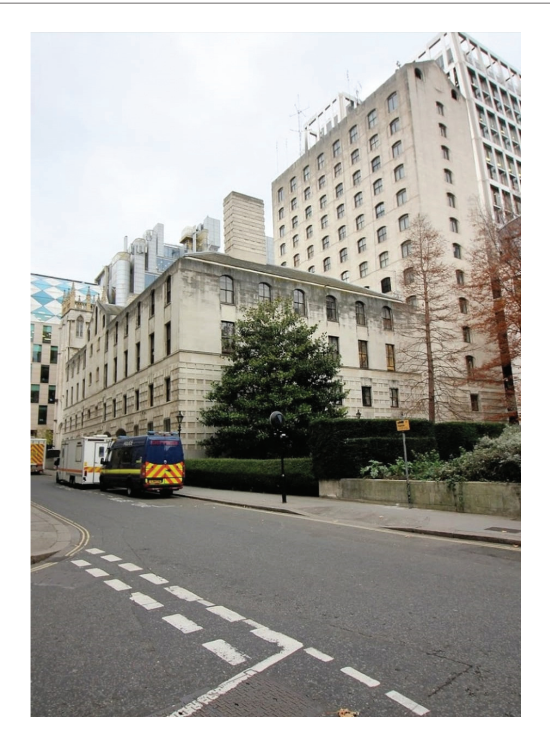
The Property Wood Street Police Headquarter, 37 Wood Street London EC2 UK